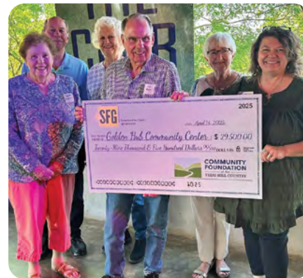
Sisterhood for Good Fredericksburg Nonprofit Awardee: Golden Hub Community Center for $29,500

After the Crabapple Fire in March 2025, the Community Foundation made grants to support Gillespie County volunteer fire departments and affected property owners, in partnership with the Hill Country Community Needs Council and the OneStar Foundation.