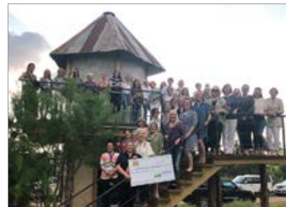
Over 200 women amplify their giving in Sisterhood for Good .

Last year the Foundation covered professional development conference expenses for several local nonprofits' staff, underwrote multiple fundraising workshops, and hosted its annual Nonprofit Summit , convening 75 Hill Country leaders.