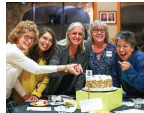
Kerrville Sisterhood for Good Leadership Team celebrates granting over $19,000 to Kerr-area nonprofit organizations in 2022.