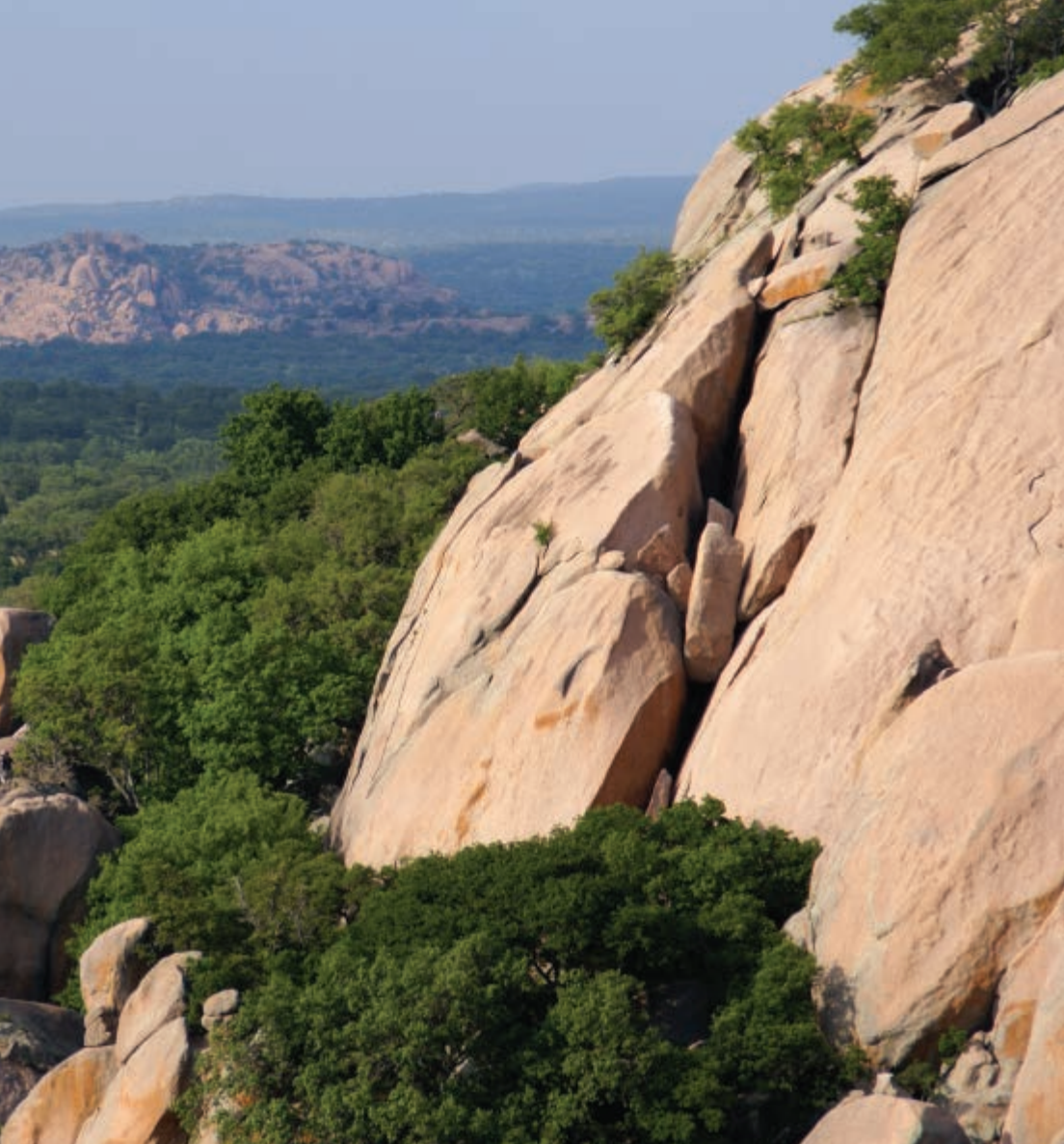
Enchanted Rock, on the border of Gillespie and Llano counties, is the largest monadnock - an isolated rock hill - in the United States. It's an icon of the Hill Country.

The Community Foundation of the Texas Hill Country is our region's philanthropic endowment. As a public charitable foundation, our mission is to support a thriving Hill Country by: