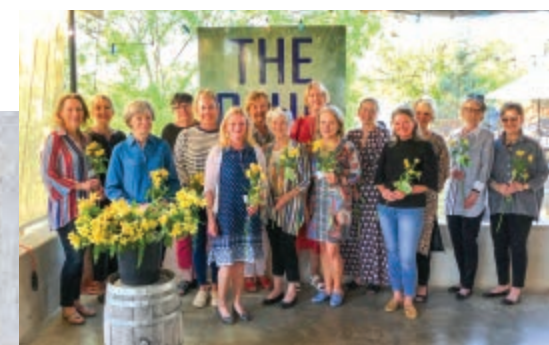
Sisterhood for Good in Fredericksburg: Dessert Dash Table Winners show off their cake choice. SFG Fredericksburg granted almost $26,000 to Gillespie-area nonprofit organizations in 2022.