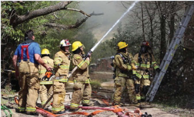
Established as an endowment, the Fredericksburg Firefighter Relief Fund will financially support any Gillespie County volunteer firefighter injured in the line of duty.

The Kerrville Police Department Foundation Fund allows residents to contribute to the Department's various needs. This year's campaign raised funds for a drug dog and all of the related equipment and training. More than 100 donors supported the effort.