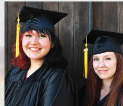
GED graduates of Families & Literacy celebrate completion of their course requirements.