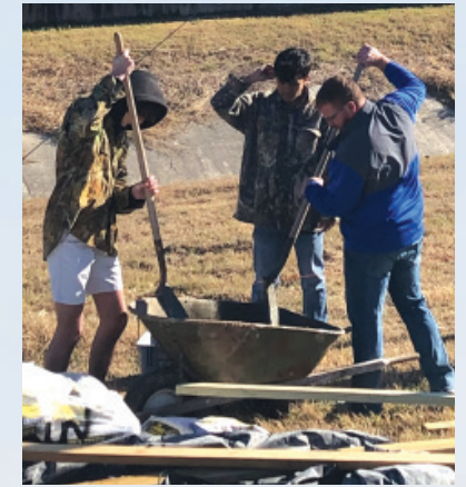
The Foundation granted $30,000 to Habitat for Humanity in Kerr County to help build its #114, #115, and #116 homes.