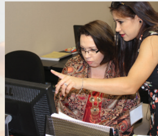
Over $50,000 was collectively granted to Families & Literacy , and the Christian Men's and Women's Job Corps in the area. These organizations provide essential skills training for adults.