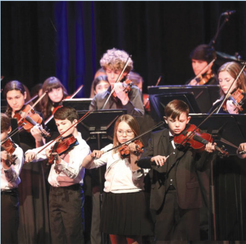
Pictured above are students performing at a recent concert.

ARTS are essential for a thriving community; The Foundation granted over $275,000 to arts organizations last year including a $15,000 unrestricted grant to Hill Country Youth Orchestras .