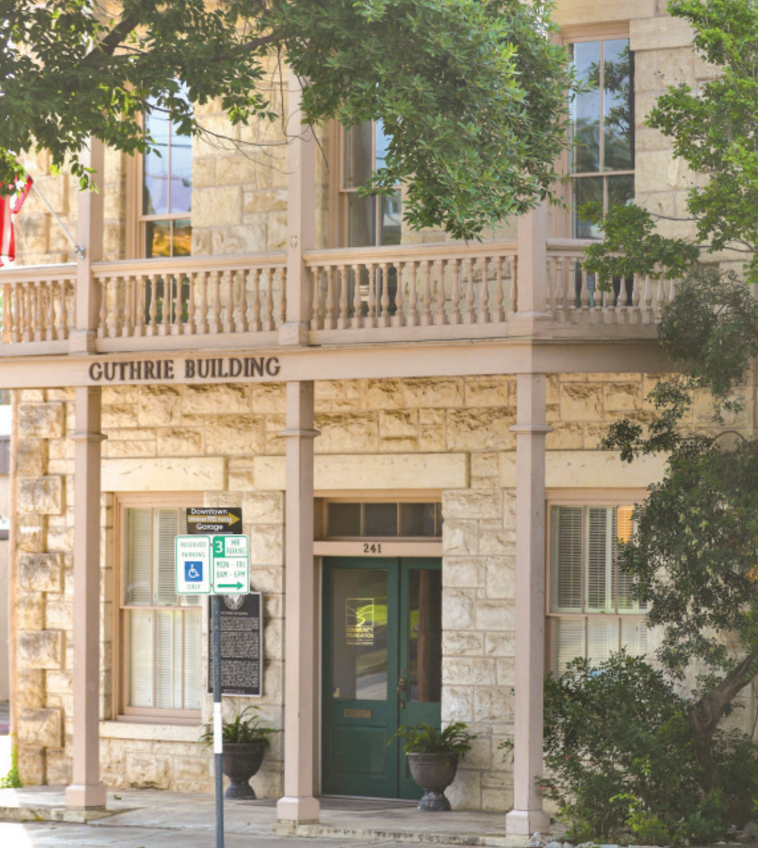
The historic Guthrie Building is the Foundation's new headquarters.

The Community Foundation of the Texas Hill Country is our region's philanthropic endowment. As a public charitable foundation, our mission is to support a thriving Hill Country by: