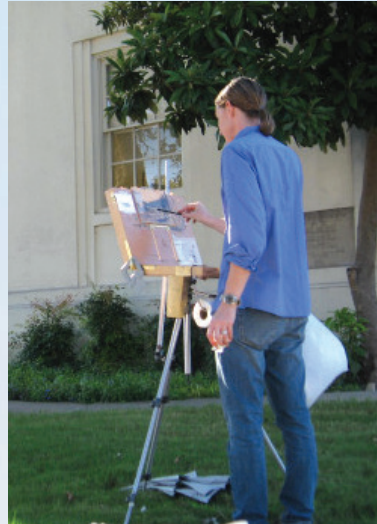
The John J.B. Miller Arts Fund will support arts in Kerr county.